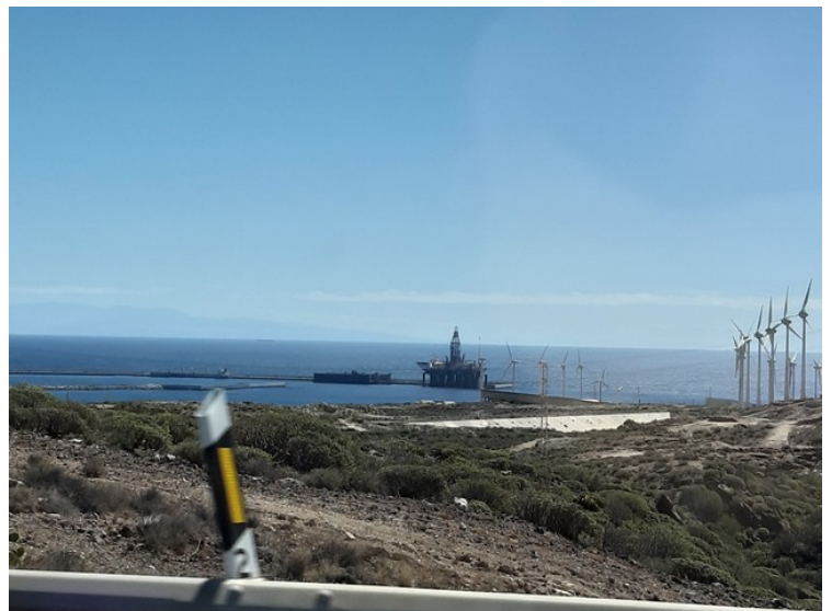
Here we are on the highway north and have arrived at the municipality of Granadilla , just north of the airport. Here is the largest industrial port in the Canary Islands, Puerto Industrial de Granadilla. The port was officially opened on March 2, 2018.