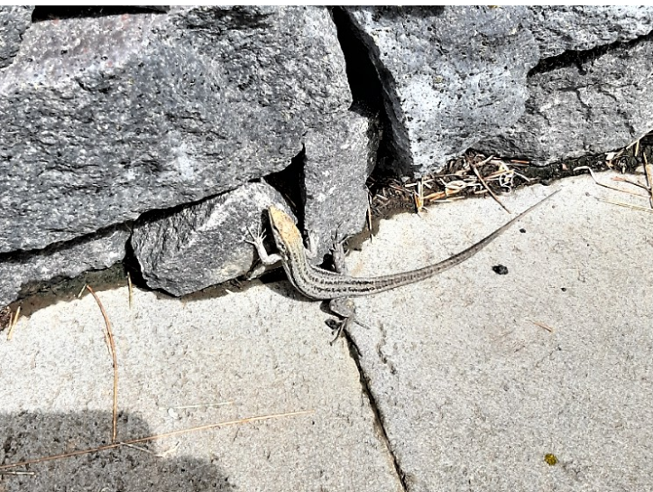
This is a real lizard that lived here.