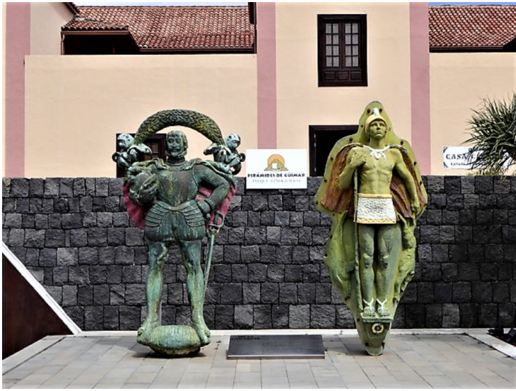
A statue of a Spanish conqueror and a Guanche . The Guanches are the oldest known population group in the Canary Islands, which are now either extinct or assimilated with the European immigrants.