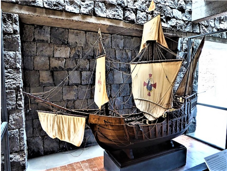
A miniature copy of the sailing ship, Santa Maria , with which Christopher Columbus traveled to America in 1492.