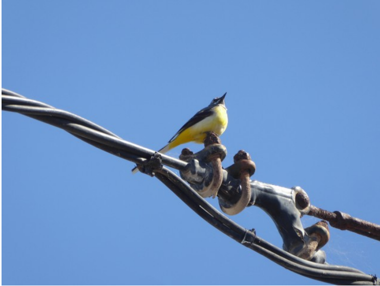
We were visited by a Western yellow wagtail one of the days.