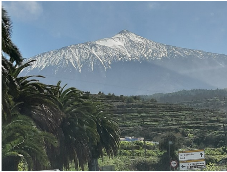
Teide is clearly visible most of the way.