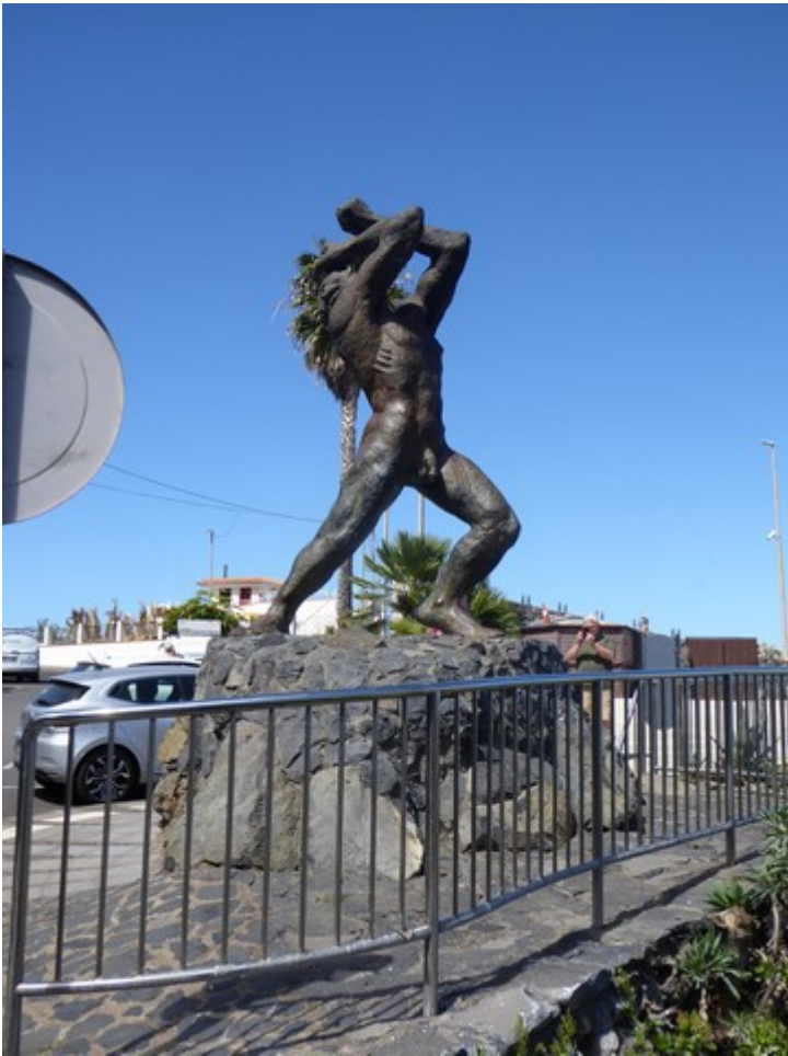
At the vantage point stands this bronze statue. It's Mencey Bentor, a guancho king who chose to jump off the cliff here instead of being captured by the Spanish troops who conquered the island.