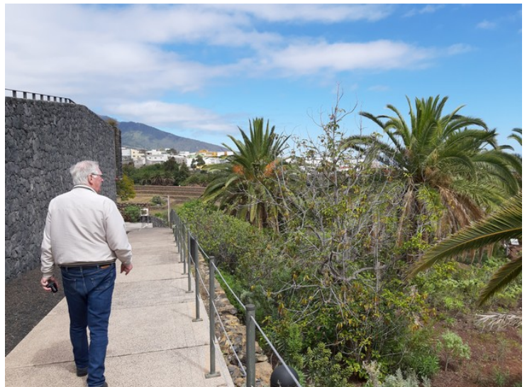
Documentation that I was there.

In 1998, a 65,000 square meter area around the pyramids was transformed into an ethnological park with an information center. There is a museum, Casa Chacona, with exhibits showing the results of the excavations. There is an auditorium where films from Heyerdahl's expeditions are shown. An important financial contributor to the center and the park was the Norwegian shipowner Fred Olsen .