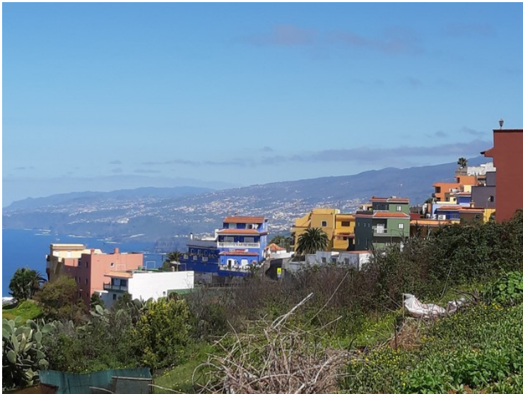
Then we drove on. We can still glimpse the Orotava Valley.