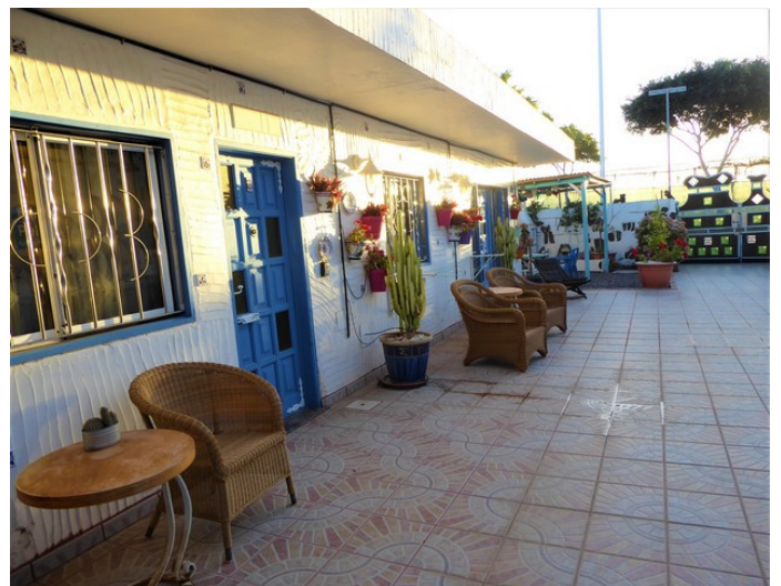
Then we were on our way out to return to Norway.

We had to be out of the apartment before 11am.