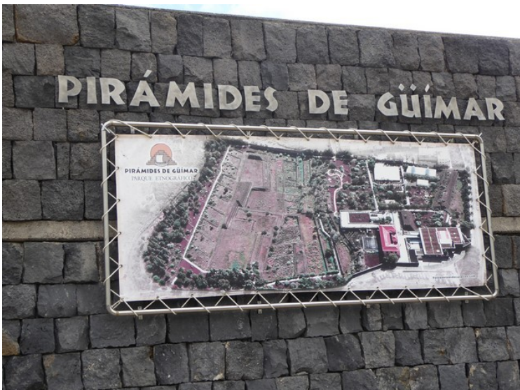
The first stop was at the Pyramids of Güimar .