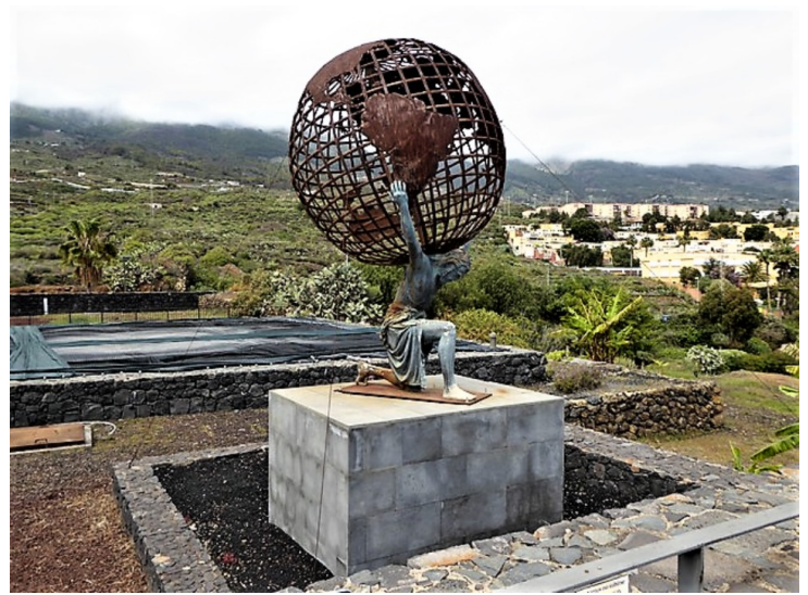
A statue of Atlas carrying the globe on his shoulders.