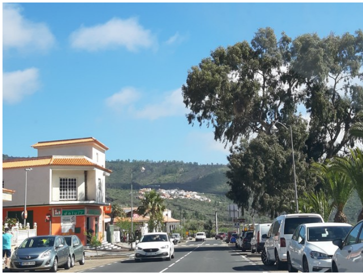
Here we have come to Santiago del Teide .