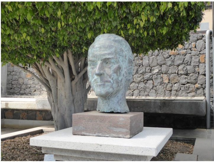
A bust of Thor Heyerdahl.