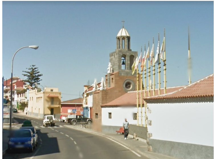
This is in Icod el Alto .