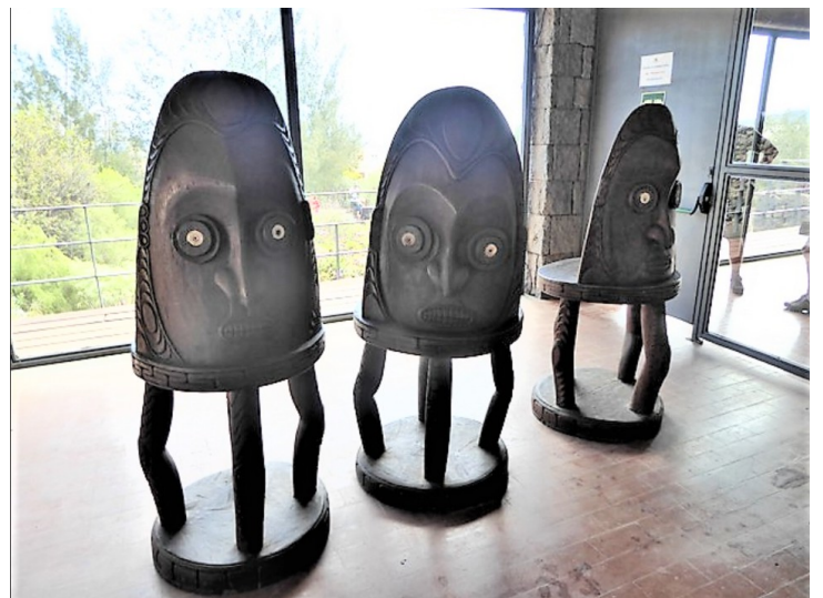
Chairs, front and back.