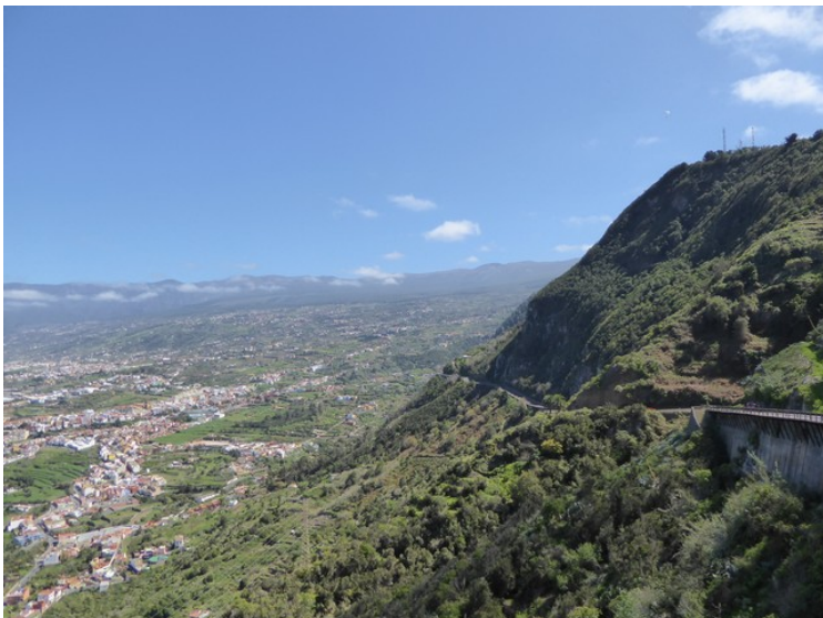
To the right we see the road where we came up. In the background we see La Orotava.