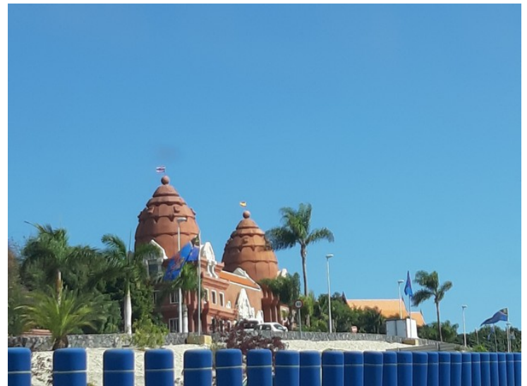
Here we drive past Siam Park in Costa Adeje .