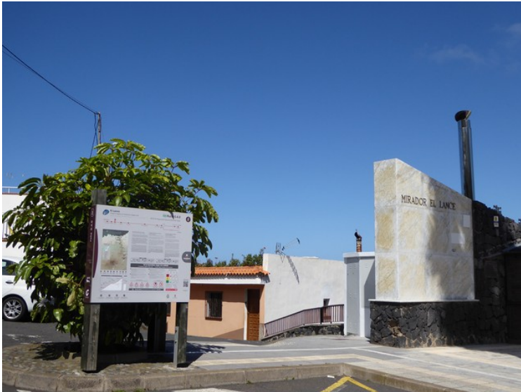
We stopped at a vantage point called Mirador el Lance .

Here we have driven on to the northwest coast and see Teide again in the distance. The motorway ended a little south of Puerto de la Cruz . The main road continues along the coast further south, but here we drove through Los Realejos and up the hill again. The area here is called the Orotava valley which arose 560,000 years ago after a large landslide. The largest places are La Orotava , Los Realejos and Puerto de la Cruz, which is the port city of La Orotava.