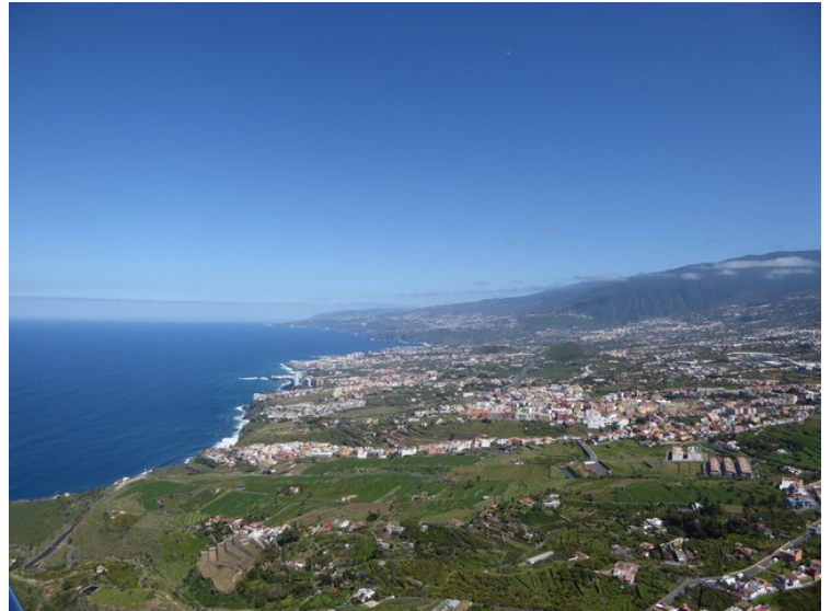
View north towards Los Realejos and Puerto de la Cruz.