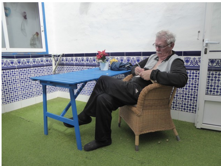
I solve Sudoku on the patio.