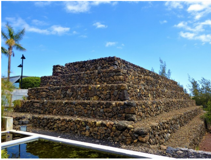
This is the pyramid that stands right inside the entrance.