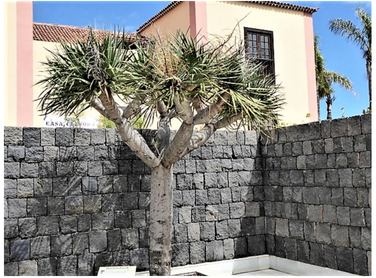
A little dragon tree . If the trunk is damaged, a blood-red resin, 'dragon's blood', emerges, which in natural medicine and alchemy was praised for its supposed medicinal effects and magical powers. The oldest dragon tree is said to be 1000 years old and stands in the city Icod de los Vinos .