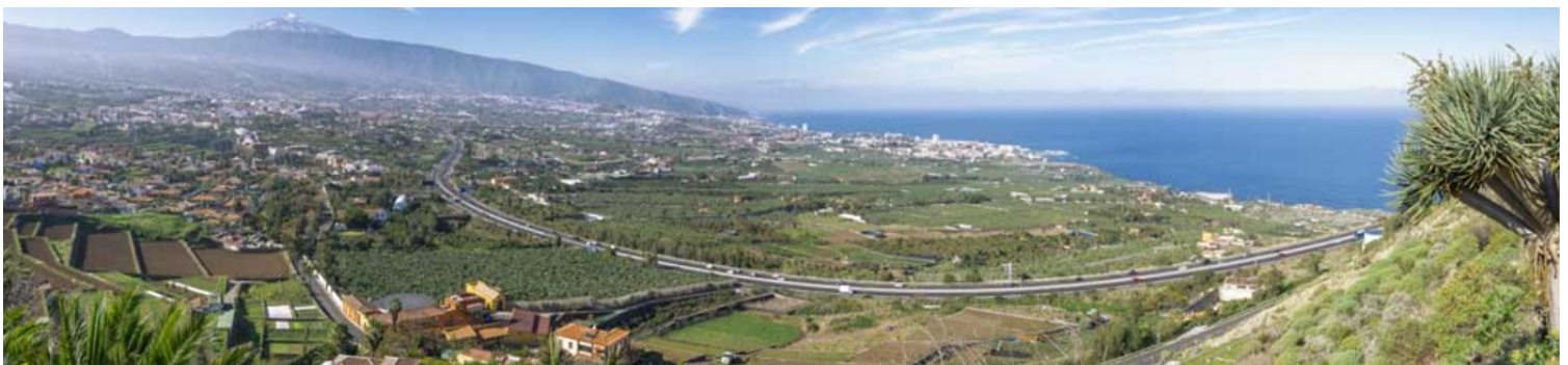
The Orotava valley seen from northeast.