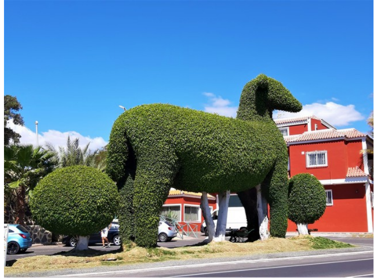
Outside the Cordero restaurant in Guargacho, they have cut the trees so that they look like a big horse.