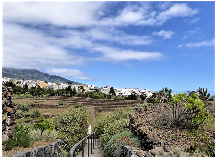
There are several pyramids further away.