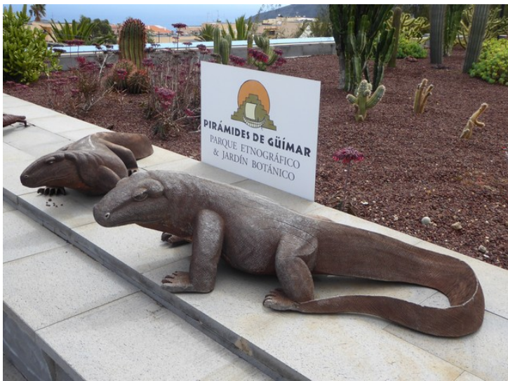
Statues of komodo dragon .