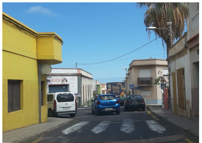
On the way through Güimar down to the motorway.