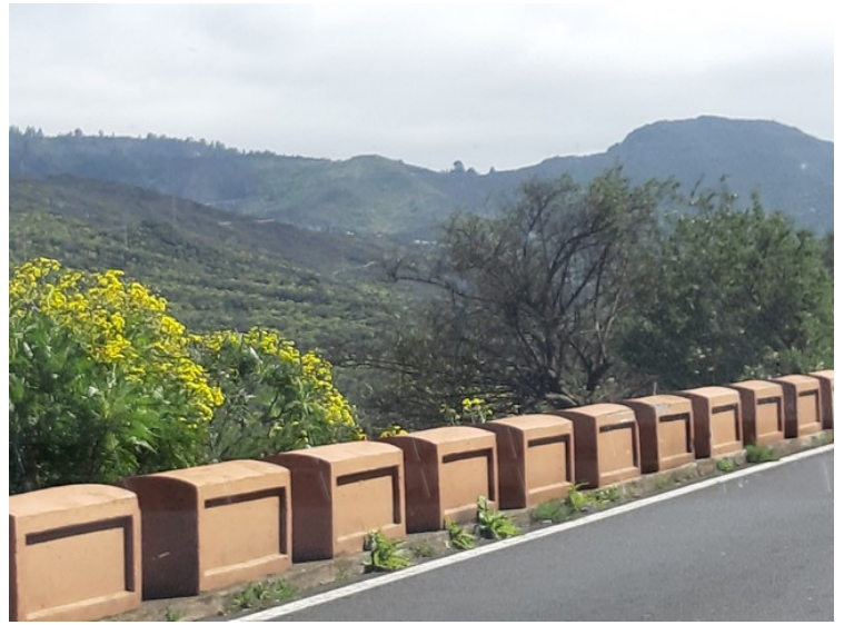
This is modern stones.