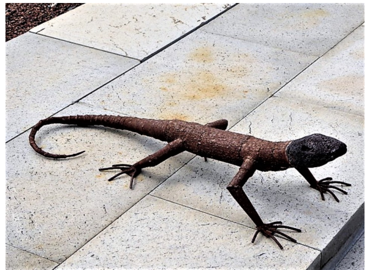
Statue of a Canarian lizard . There are 7 species and they only live in the Canary Islands.