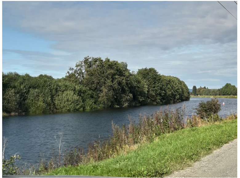
We then drove back to Engen and all the way south where we turned around. We have Vesleåa on one side all the way.