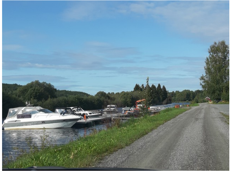
Then we are back at the marina. From there we drove home via Skarnes.