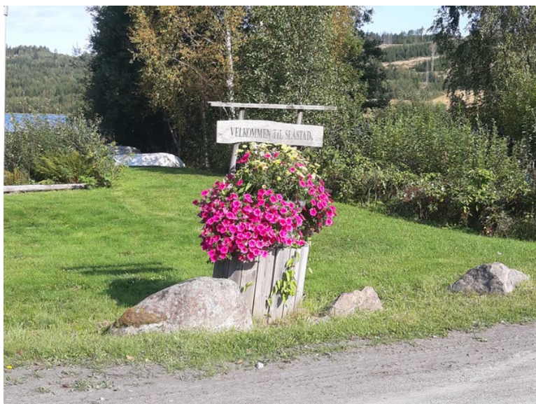
Here they have decorated the crossroads with flowers.