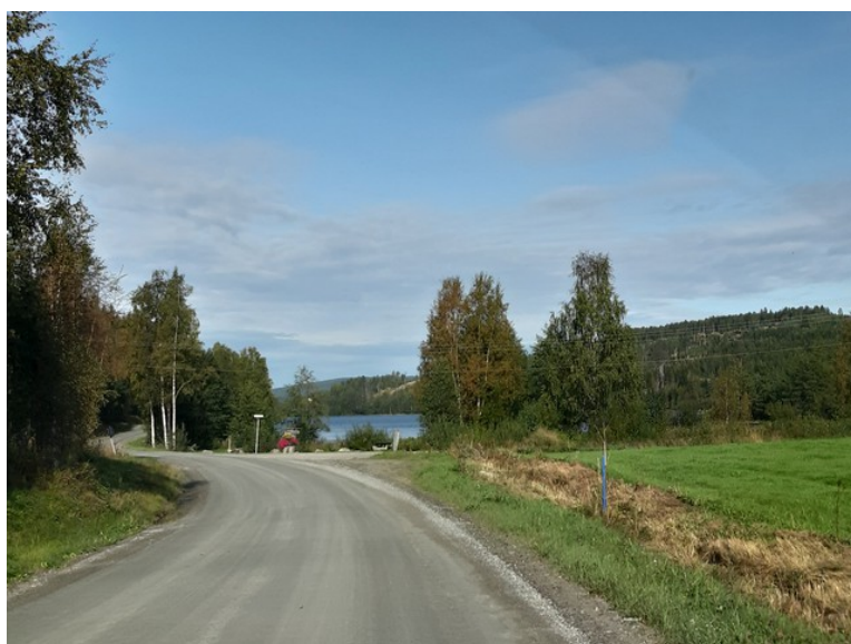
Here we come to Nabben and get a glimpse of Dølisjøen .