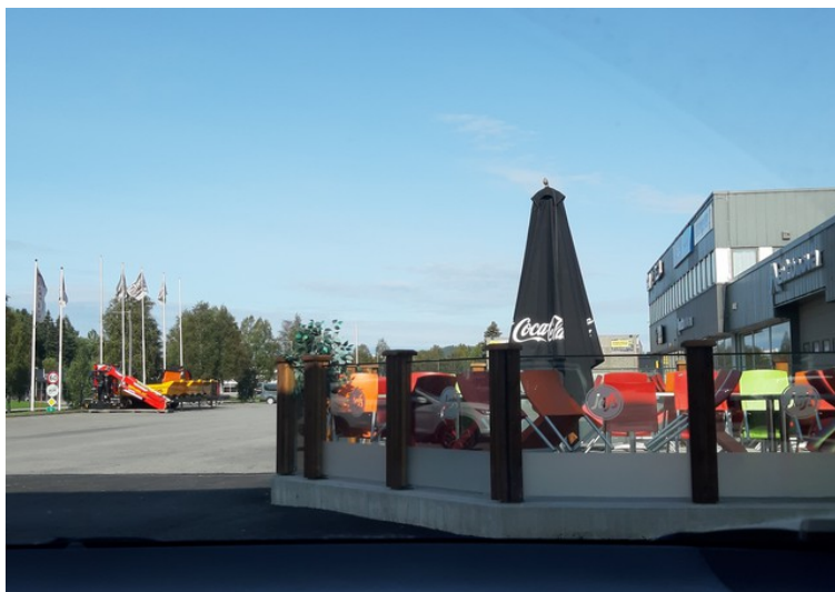
We started by filling up with gas at Uno-X at Rasta .

This day we drove a trip to Storsjøen in Odalen. We drove the motorway to Sander and from there via Slåstad and Kjølstad