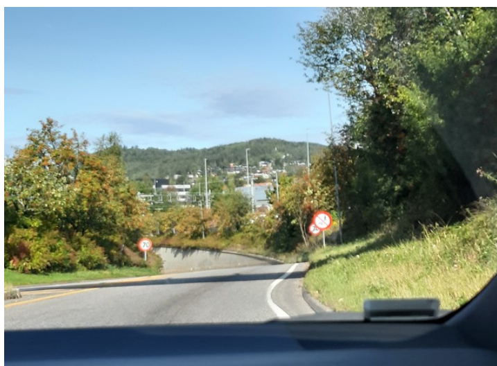
Here we come to the tunnel under the railway at the Sunde corner.