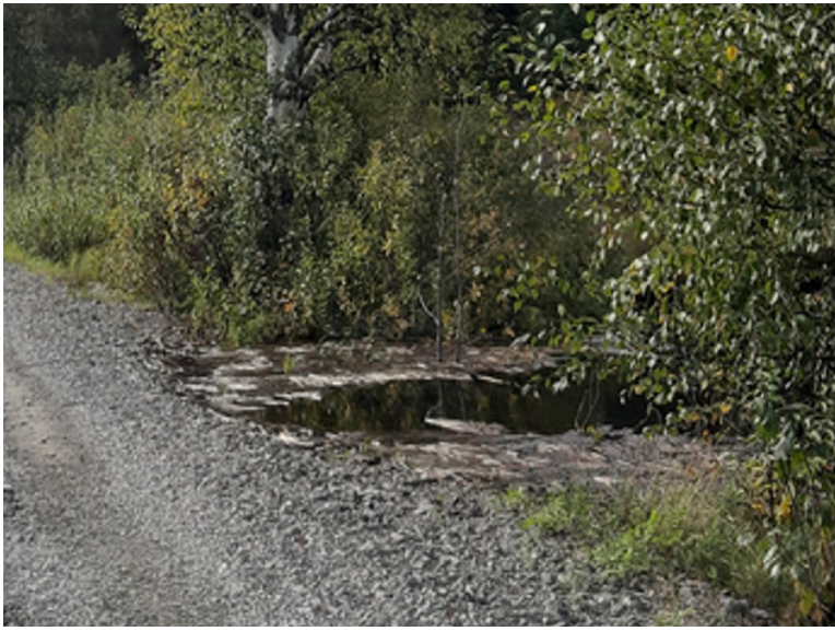
The road between Engen and Øyen runs on an embankment in Nora. There is little clearance down to the water.