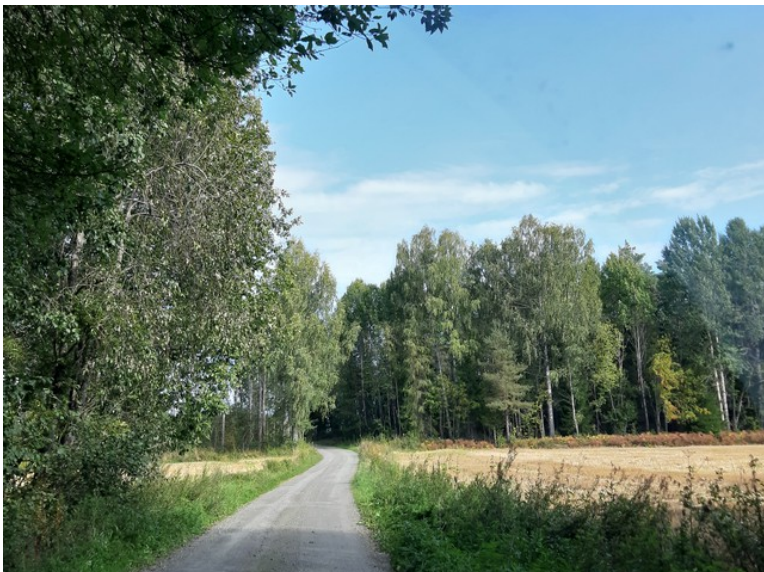
There are also cultivated areas. There are two farms here today that are permanent resident.