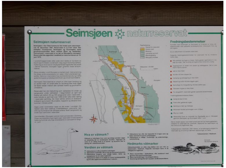
At the end of the bridge there is a poster telling about the Seimsjøen nature reserve.

Storsjøen is connected to Glomma through Oppstadåa . Normally the water flows from Storsjøen to Glomma, but when there is a flood in Glomma, the current reverses and water flows into Storsjøen. This affects the current in the Vesleåa in the same way, which therefore goes either one way or the other. Storsjøen is a shallow lake, 2-3 m deep.