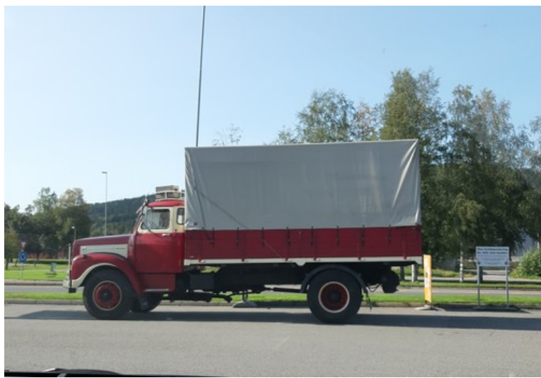
There was an old type truck here.