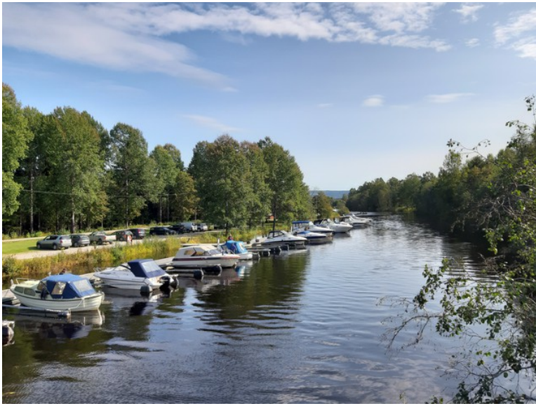
View south along Vesleåa.