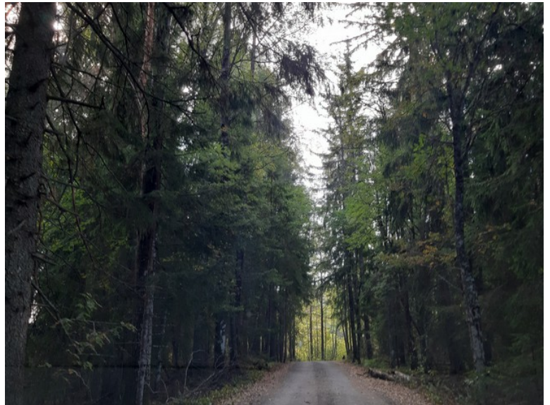
Here we have driven over to Øyen through a wooded area. The island is the largest island in the Great Lakes.