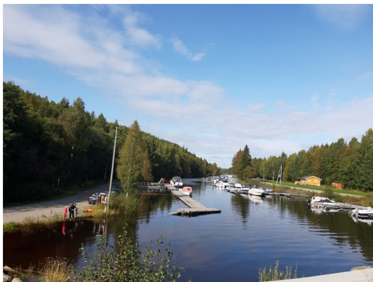
Then we have come to the bridge across the Vesleåa river by Storsjøen . This is a view to the north.

The bank to the right is on an elongated island called Engene . It is almost 5 km long. The quality of the hay that is cut here is said to be particularly good.