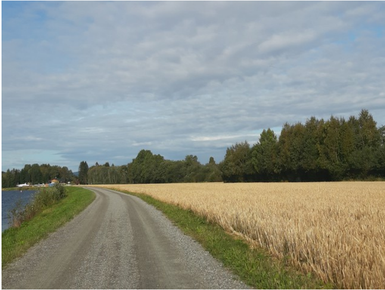
The grain has not yet been harvested.