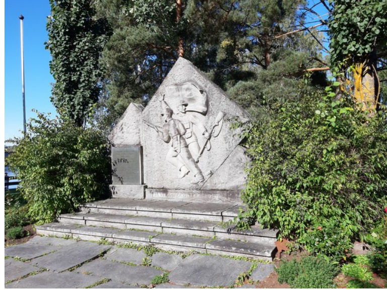
This is a monument to remember nine Nesbuers who fell during the Second World War.