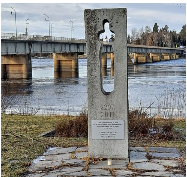
This is a memorial after the terrorist attack on <u>Utøya</u> in October 2022.