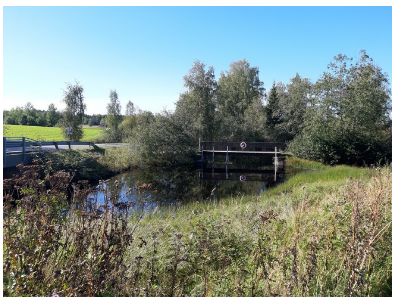
Here we have driven on to the <u>Auli mill</u>. Here we see the dam.