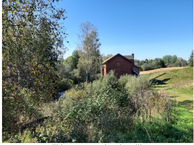
This we approaches the mill.