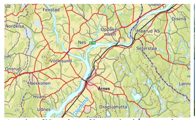
A section of <u>Norgeskartet</u>. Vormsund and Årnes are shown here.

That day we were going to Årnes to change a birthday present. We drove the highway to <u>Vormsund</u>. That is a small village where E16 crosses <u>Vorma</u>, a river that flow from <u>Mjøsa</u> to <u>Glomma</u>.