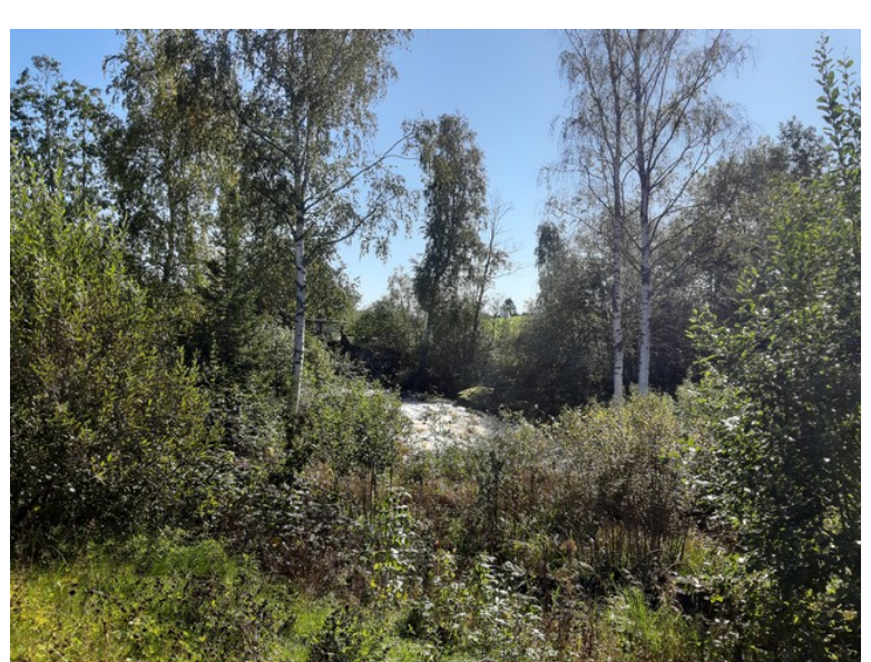
A waterfall below the dam.