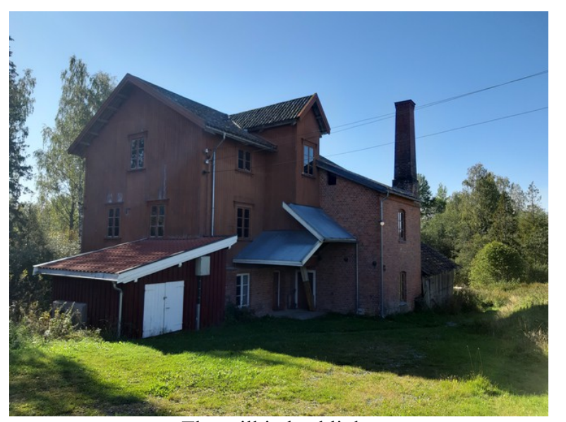
The mill in backlight.