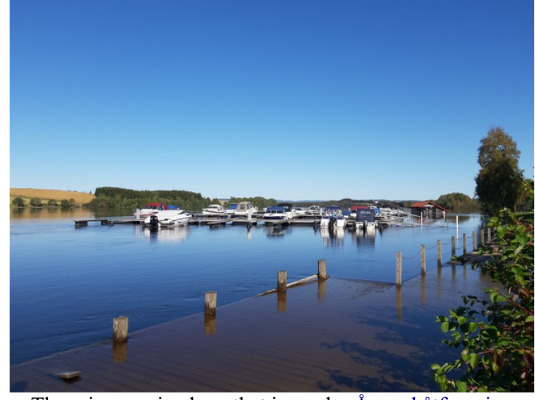
There is a marina here that is run by <u>Årnes båtforening</u> (Årnes boating association).

It has room for 45 passengers. Visitnorway