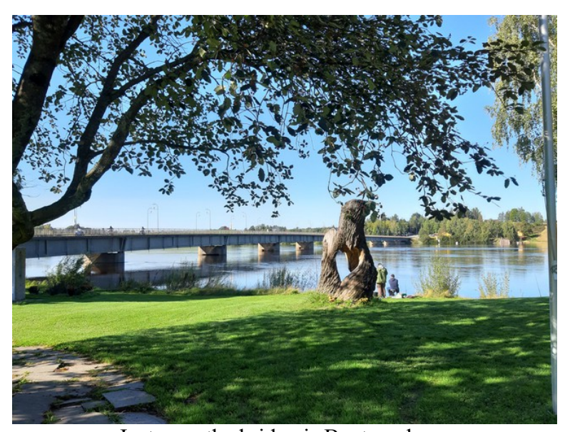
Just over the bridge is Bautaparken. We see the bridge in the background.