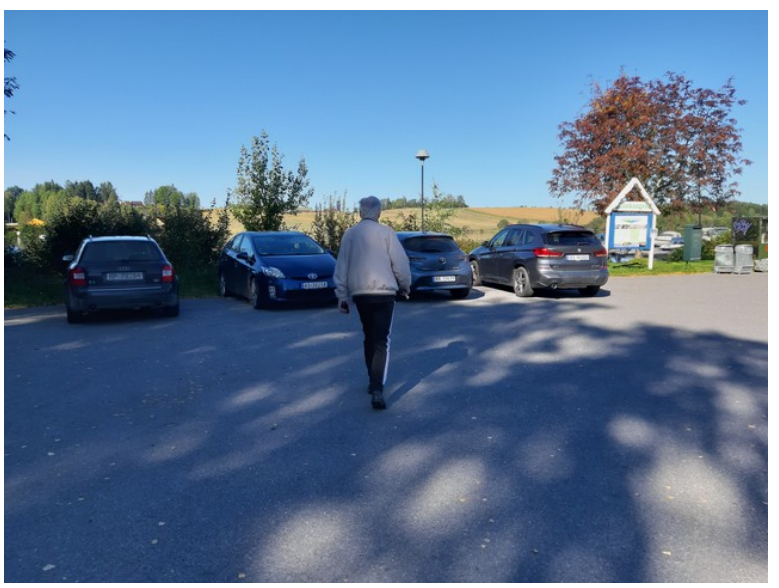
We parked at where Elvekongen is moored.