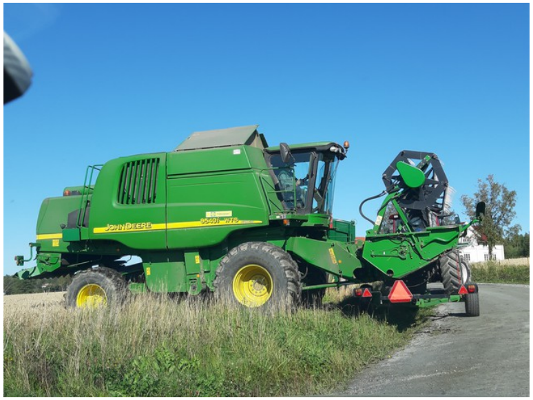
On the way home, there were activities with harvesting grain.