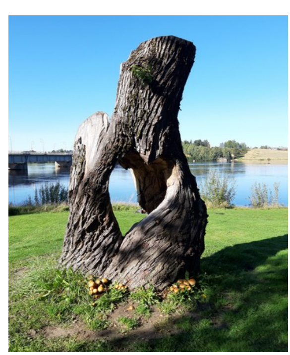
Special tree stump in the park.