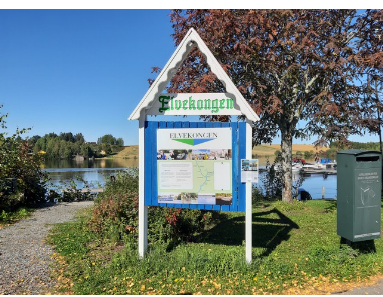
This is the poster that tells about the trips that Elvekongen makes.

It run river cruises on Glomma and Vorma on Sundays in June, July and August. It can also be chartered