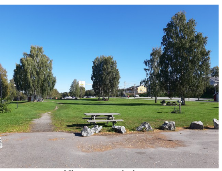
Nice area near the boats.

In Årnes we went to <u>Tilbords</u> that is situated in <u>Årnes Amfi</u>, the largest shopping center in Årnes. They didn't have the items that we wanted to have instead, so there was no exchange.