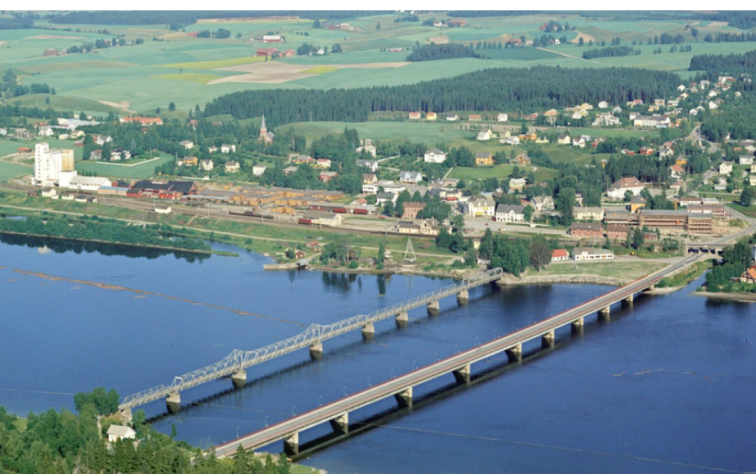
To get to Årnes, we drove over the <u>Årnes Bridge</u>. It was opened in 1963. Here we see both bridges before the old bridge was demolished.