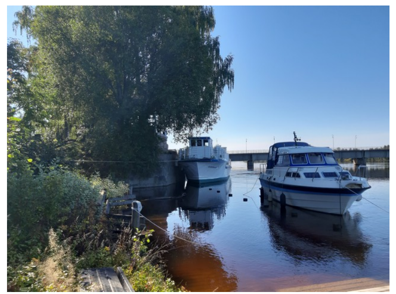
Elvekongen to the left.

M/S Elvekongen was brought from <u>Lofoten</u>. The boat has been in scheduled and charter traffic on Glomma and Vorma since 1993.